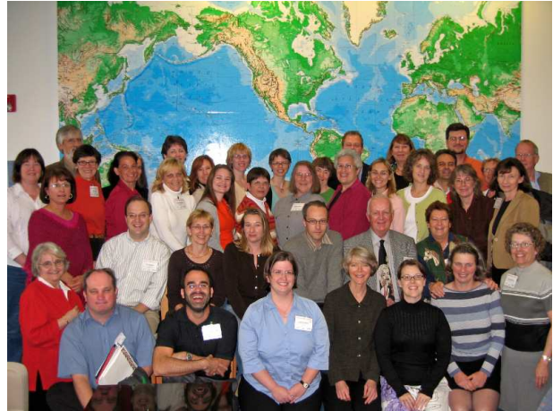
All the attendees of the 2006 SALIS and ELISAD Joint Conference