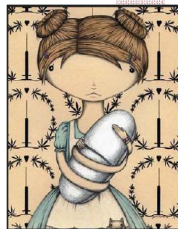
Image from Guidelines for Organizing Art Exhibitions on addiction and Recovery

Quitting tobacco use can be very difficult for anyone, including youth. My Last Dip is an online program designed through money from the American Cancer Society to help youth ages 14-25 quit chewing tobacco. The site is located at http://mylastdip.com/ with a special page for health professionals found here: http://info.mylastdip.com